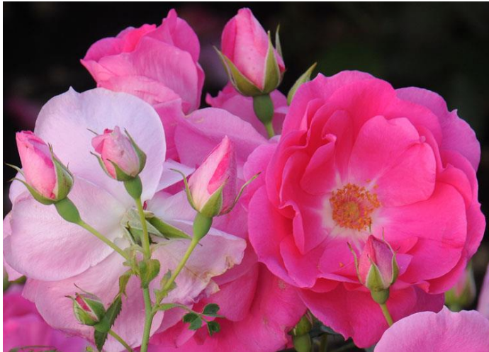
Blooms: An Illustrated History of the Ornamental Gardens at Ottawa's Central Experimental Farm.