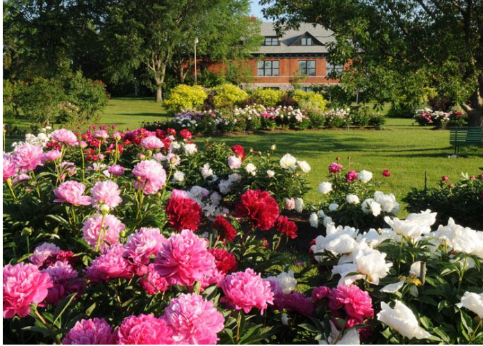
Photo by Richard Hinchcliff, Blooms: An Illustrated History of the Ornamental Gardens at Ottawa's Central Experimental Farm.