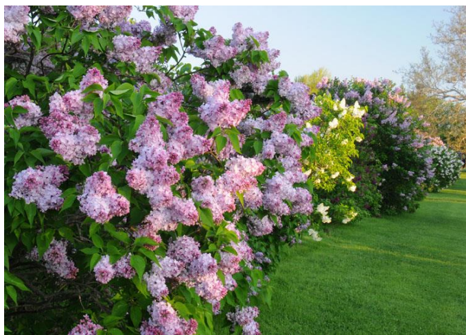
Photo by Richard Hinchcliff, Blooms: An Illustrated History of the Ornamental Gardens at Ottawa's Central Experimental Farm.